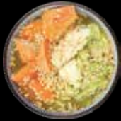
JAPANES FISH BROTH 27 Zł Salmon, cabbage, carrot, sesame