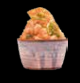
SALMON TARTARE PORTION 57 Zł 160 g