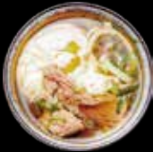
UDON SOUP 35 Zł Pork and chicken broth, udon noodles, beef, egg, oyster mushroom, pak choy, spring onion