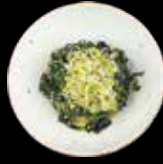
WAKAME SALAD 21 Zł Wakame, ponzu, cucumber, sesame