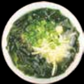
SPICY MISO SOUP 21 Zł Miso, wakame, tofu, zucchini, toban-jian, spring onion