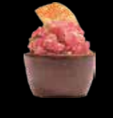
TUNA TARTARE PORTION 67 Zł 160 g