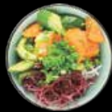
A BOWL OF VEGETABLES 19 Zł Mix vegetables (fresh and pickled)