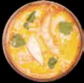
TOM KHA SOUP 33 Zł Shrimps, calamari, coconut milk, mung bean sprouts, coriander