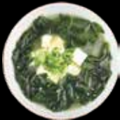
MISO SOUP 21 Zł Miso, wakame, tofu, spring onion, sesame