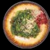
GOME WAKAME SALAD 21 Zł Wakame, sesame, rice vinegar, honey, sesame oil