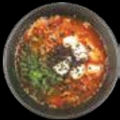
KIMCHI SOUP 31 Zł Kimchi, bacon, mushrooms, tofu, onion, rice