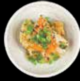
KIMCHI SALAD 21 Zł Chinese cabbage, carrot, radish, spring onion, sesame